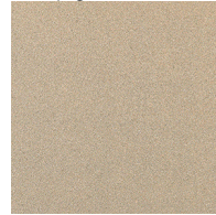
Champagne Cream - 26