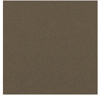
Ancient Bronze - 28